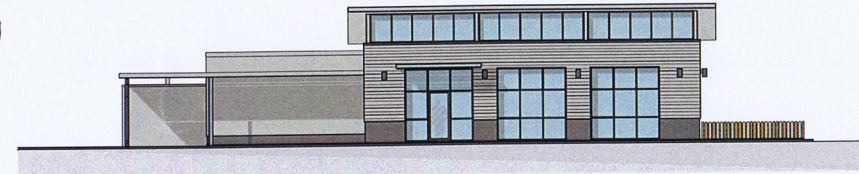
SINGLE STOREY UNIT