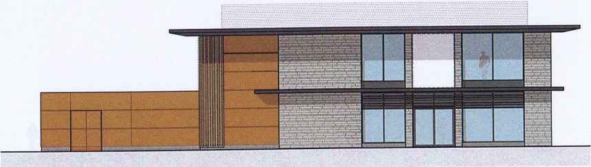
TWO STOREY UNIT